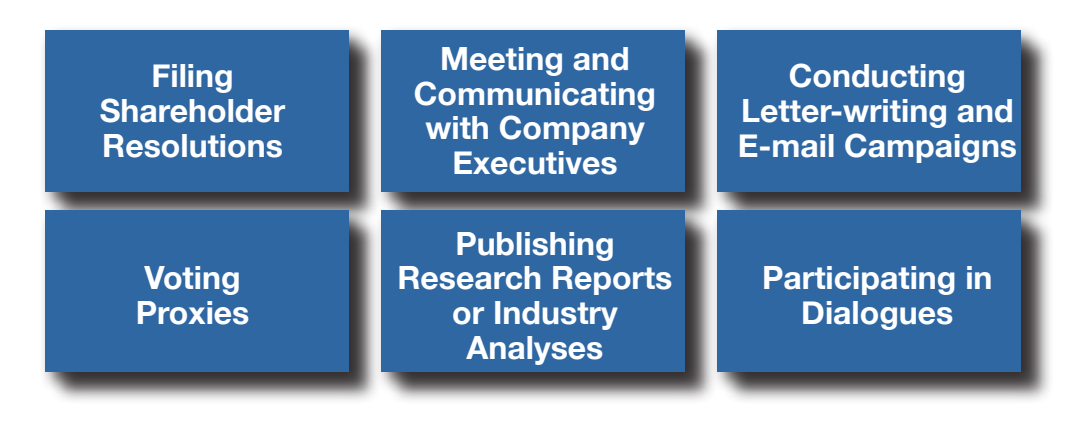
Figure 2.1: Shareholder Engagement Strategies and Tools

SRI investors have used their position as shareholders in publicly traded companies to encourage forward-looking policies and corporate improvements. The tools they can use individually or in concert with other investors and non-investor organizations are listed in Figure 2.1.