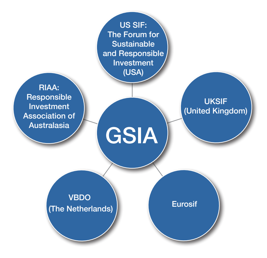
Figure 4.2: Other Membership-based Sustainable Investment Organizations

Figure 4.1: Members of the Global Sustainable Investment Alliance (GSIA)