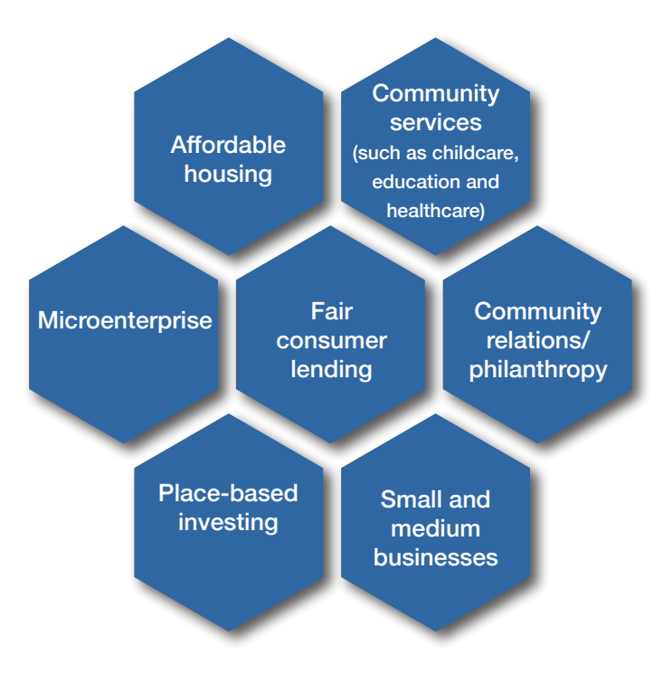
Figure 3: Community Investing: Areas of Impact

The impact of the community investment field on the local, regional and national level in the United States has grown over the years. With expanded investment opportunities across asset classes, community investing serves as another avenue of opportunity for "impact investors." Examples abound of the ways in which community initiatives by CDFIs and other types of investors have aided individuals, strengthened neighborhoods, and delivered social and environmental benefits. A few are highlighted in this section.